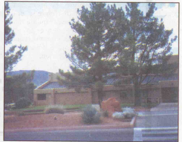
The newly renovated VOCA Community Center, recipient of a Keep Sedona Beautiful, Inc. annual award for exemplary architecture

(3) The exceptional architecture of Tequa Plaza was also presented the KSB Award