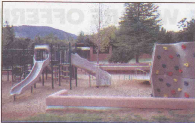
New play equipment at the KSB Award Winning Kiwanis Community Park