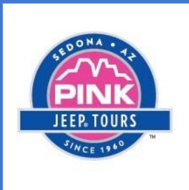
Pink Jeep Tours