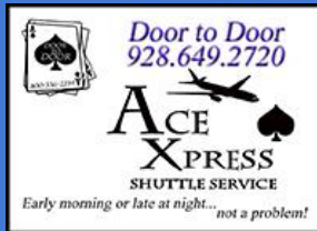
Ace Xpress Shuttle Service