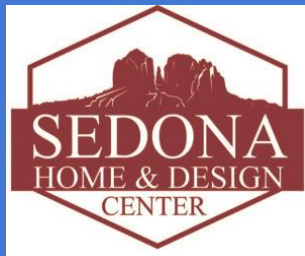
Sedona Home & Design Center