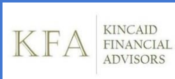
Kincaid Financial Advisors