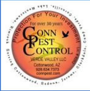
Conn Pest Control