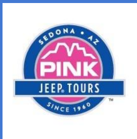
Pink Jeep Tours